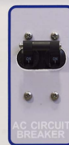
AC CIRCUIT BREAKER